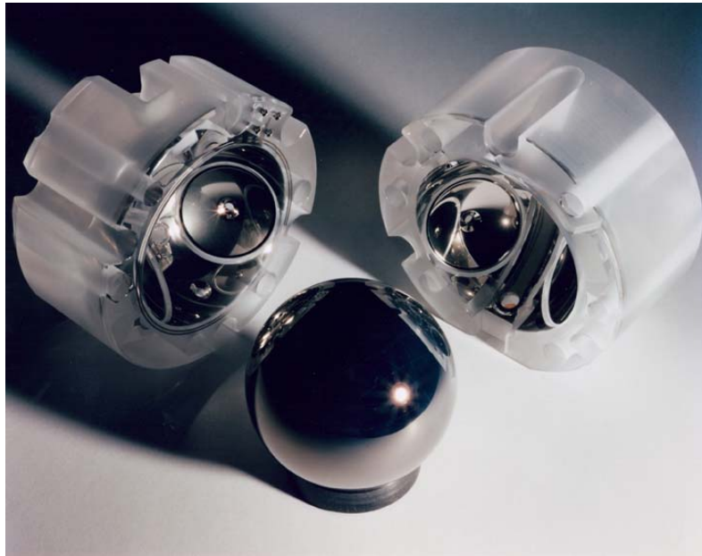
Figure 2a. The GP-B gyroscope rotors are listed in the Guinness Book of World Records as the most spherical objects ever produced.