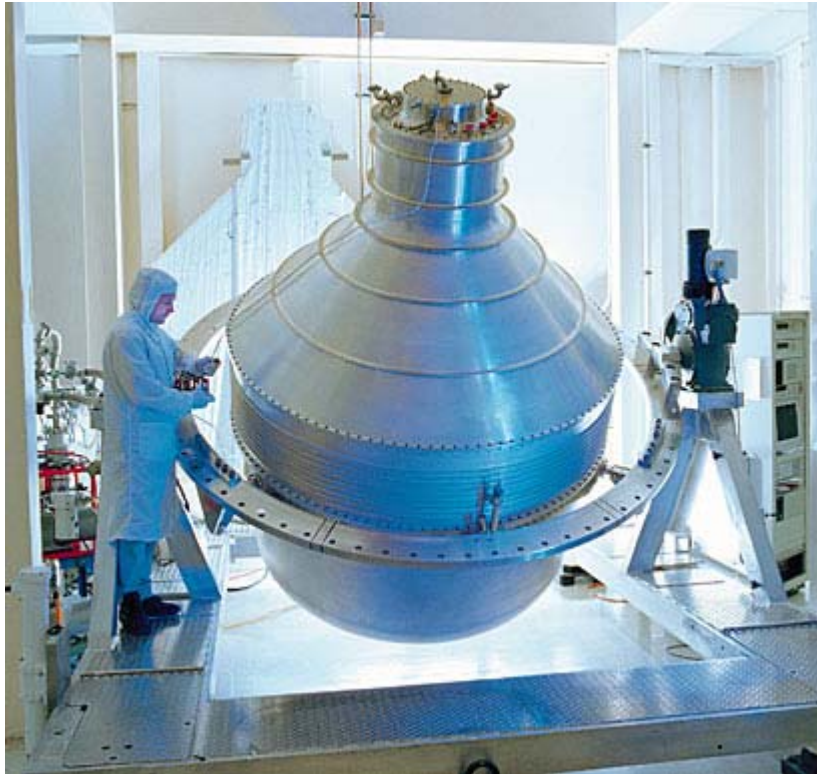
Figure 3. The Gravity Probe-B dewar was shaped like a giant Thermos bottle.