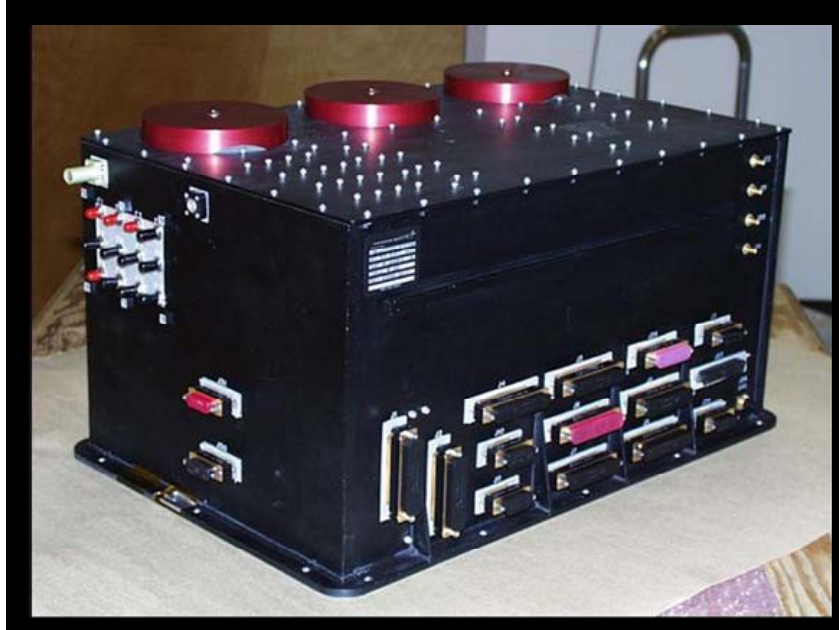
Figure 1. The Experimental Control Unit (ECU).