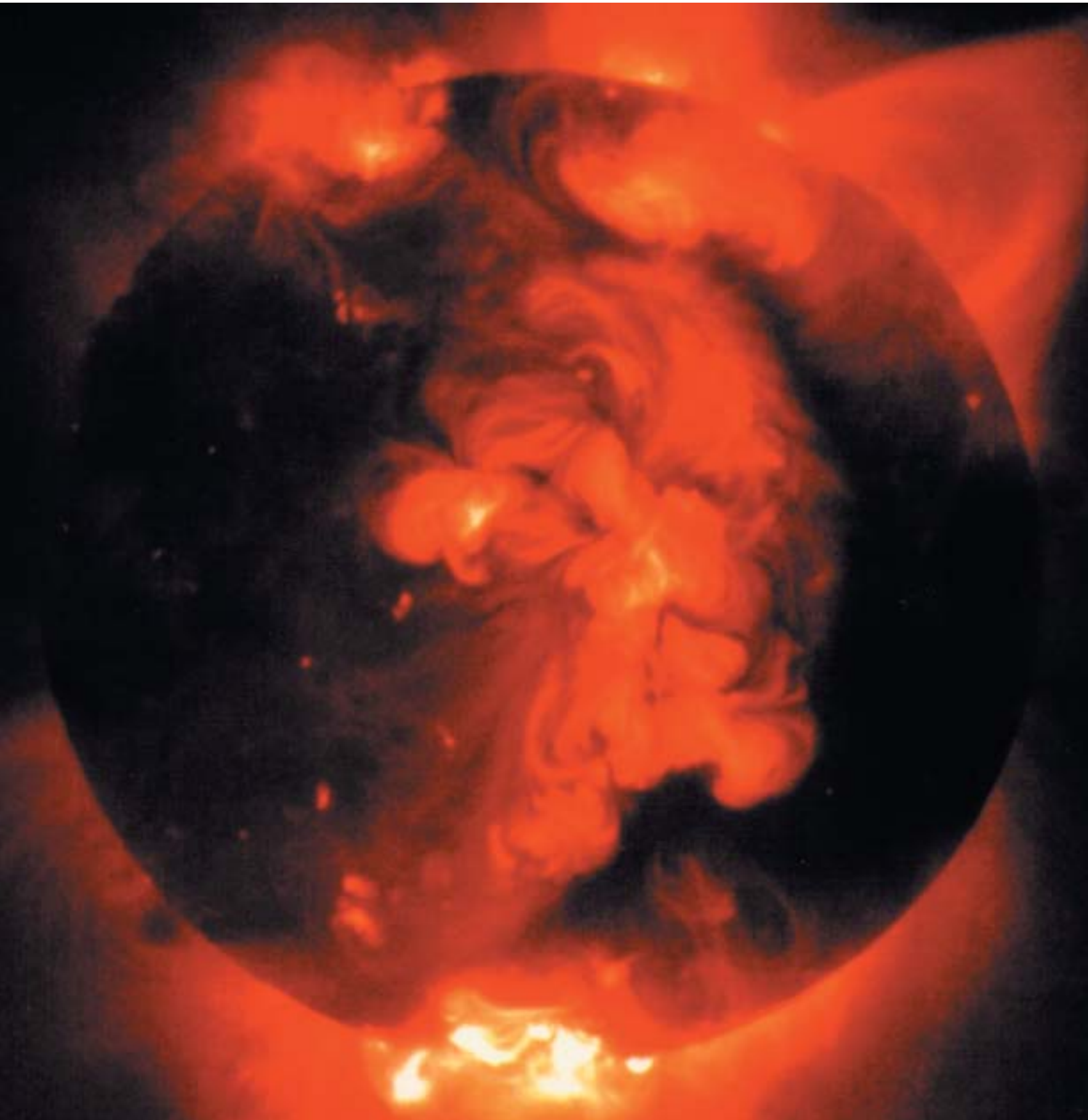
Sensors on the Advanced Composition Explorer satellite measure solar phenomena like the flares seen in this x-ray image.