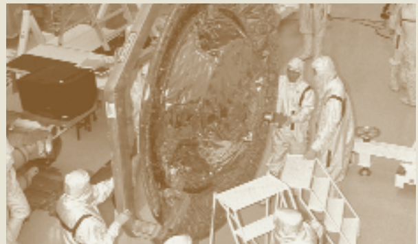
Technicians install the Huygens probe on the Cassini orbiter in the Payload Hazardous Servicing Facility.